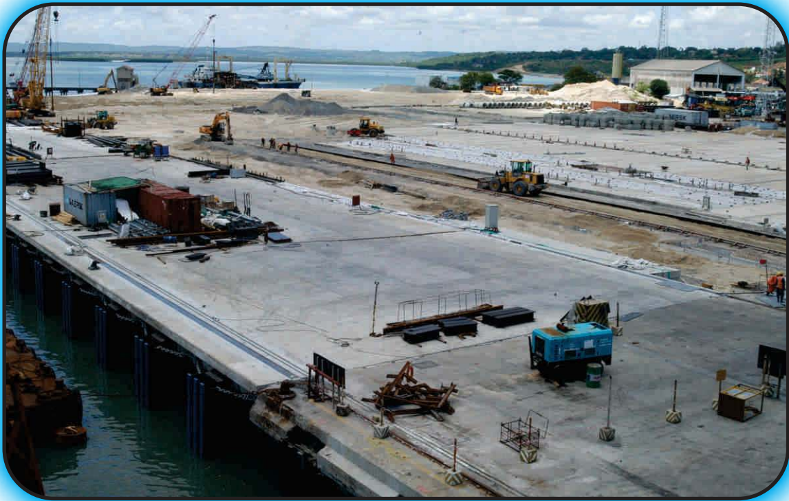
Development of Berth 19 Dec 2012