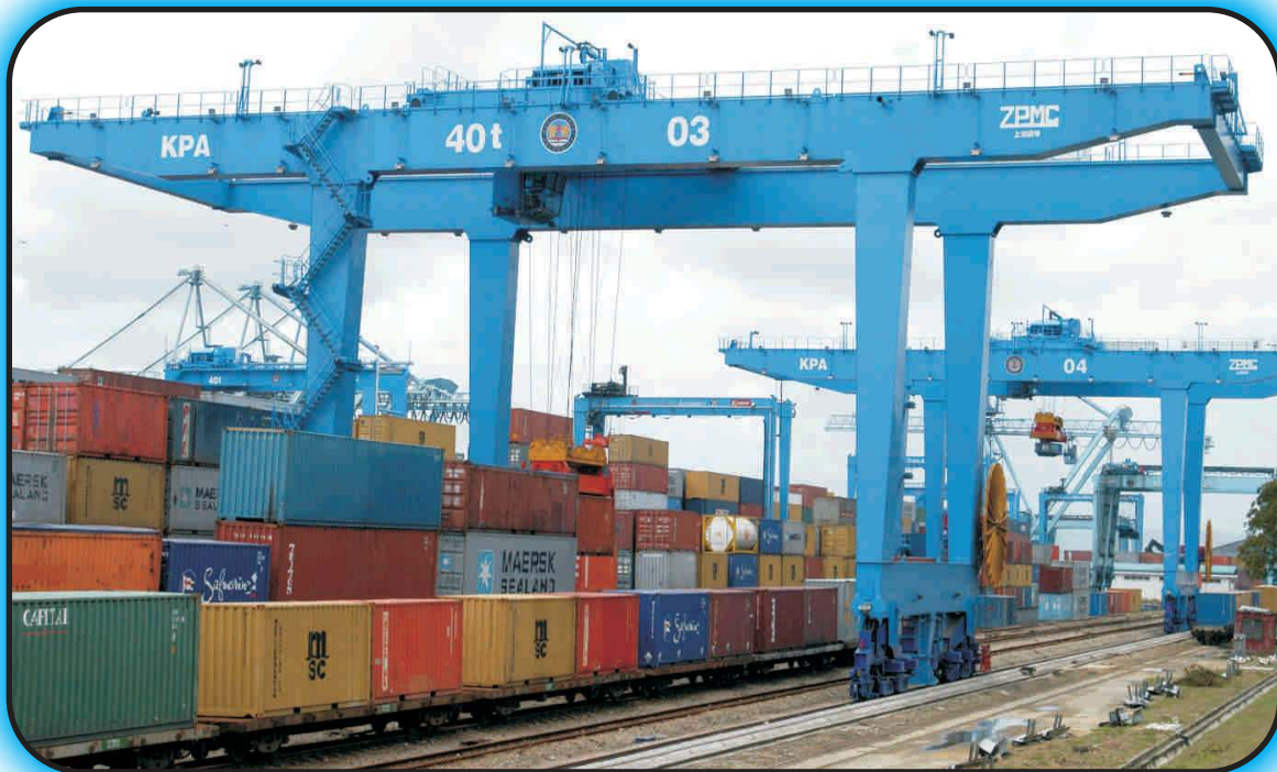
Rail mounted gantries at the terminal