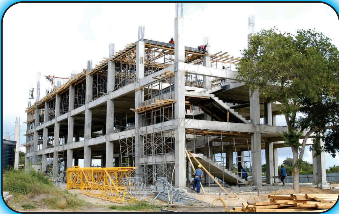
Development of Lamu port Dec 2012