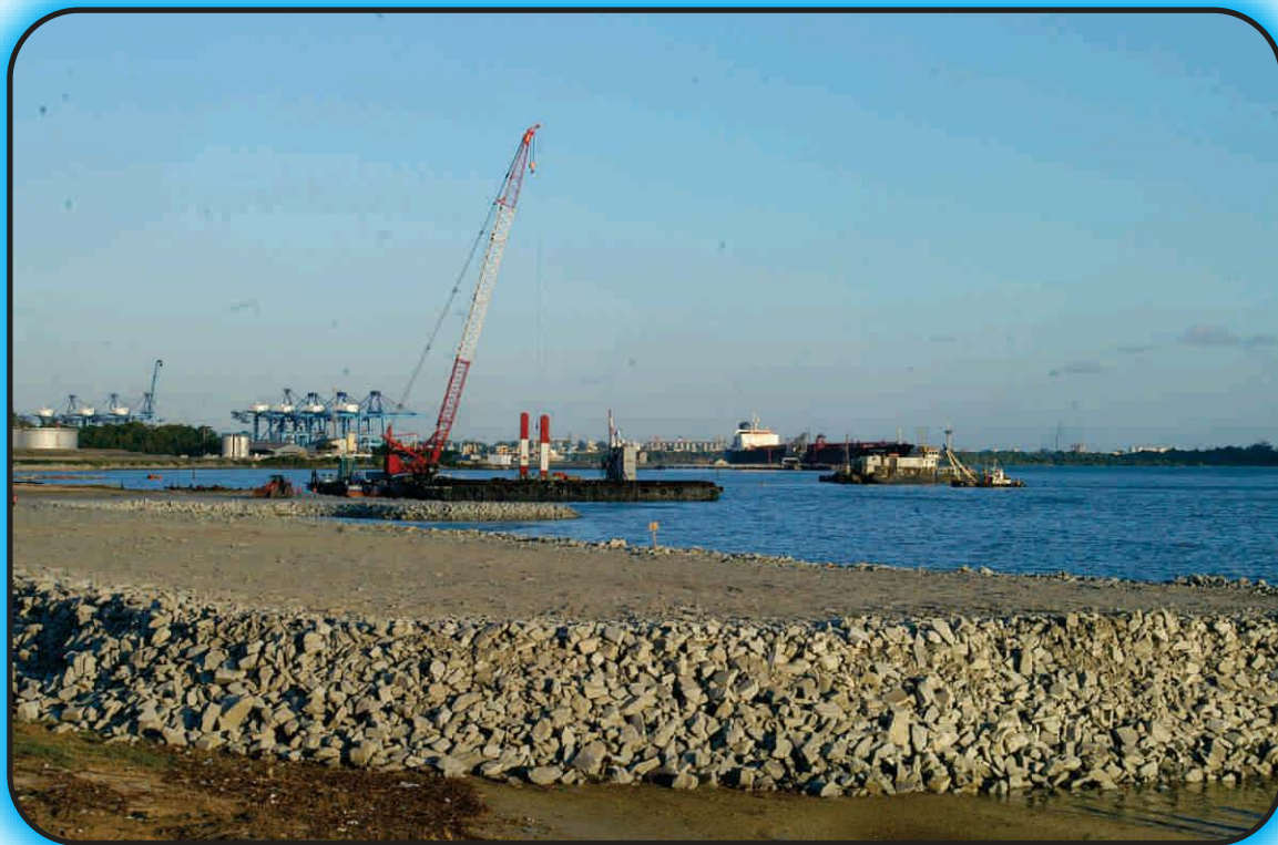
Second Container Terminal