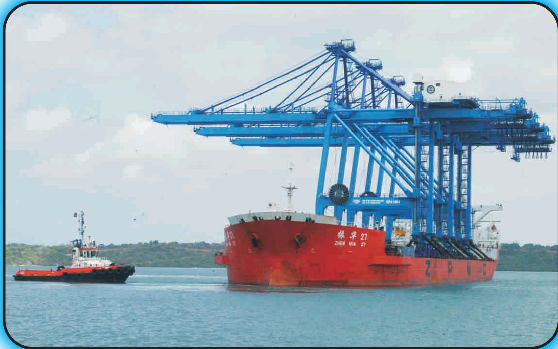
Arrival of STS cranes