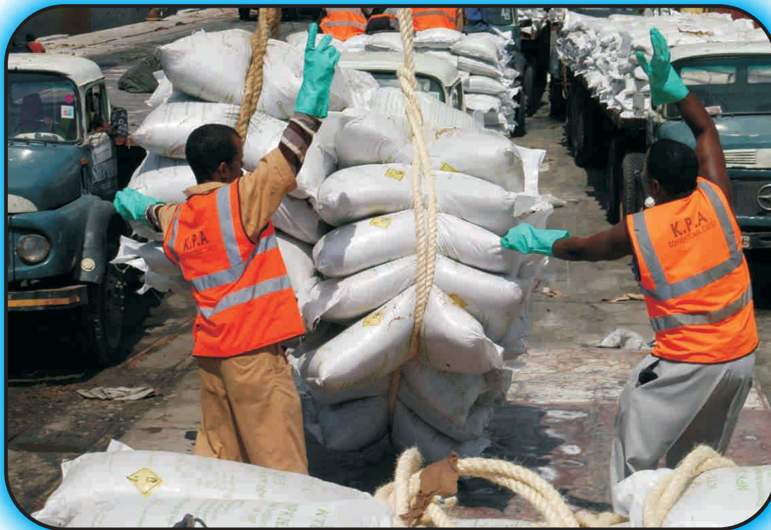
Labour hired for handling loose cargo