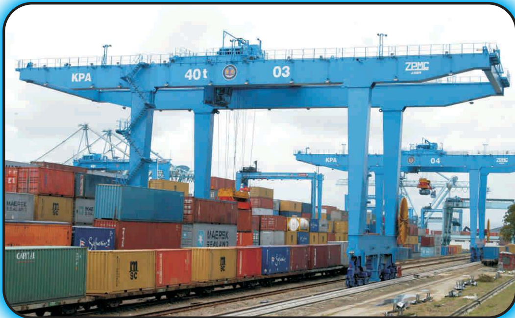
Shorehandling rail bound containers